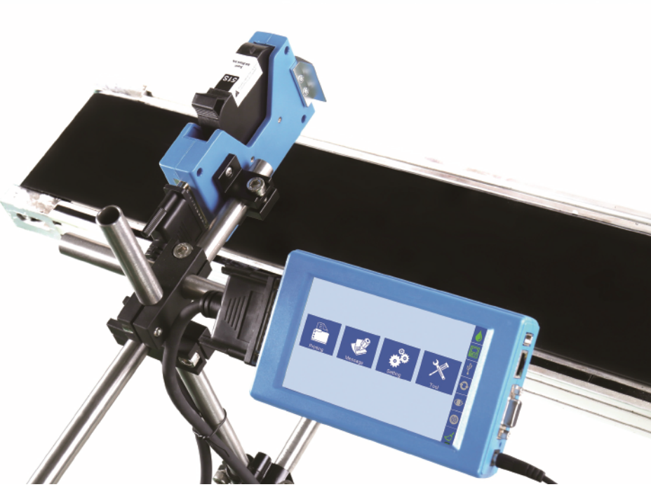
Elfin ID High Resolution Inkjet Printer